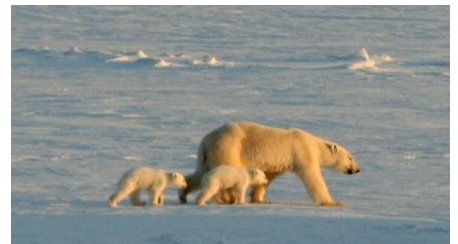
The environmental reasons are obvious, less transportation and small scale handling on-site leave a smaller carbon footprint.