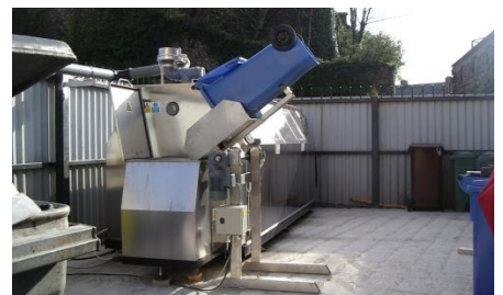
The bin lift makes it easier to handle large volumes of food waste. Talbot Hotel in Wexford, Ireland has a bin lift for their model T240.