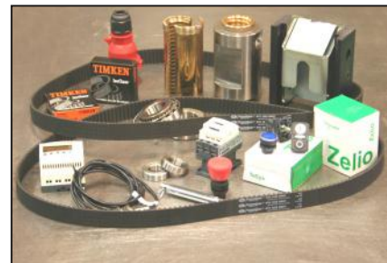
Components from global world class suppliers ensure quality and availability.