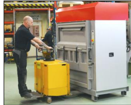
By a pallet truck the machine can be moved from side or front - rationally for placement and simplifies cleaning.