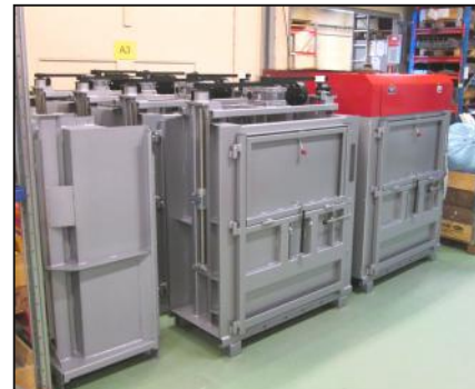
Since the mid-sixties more than 15,000 balers have been delivered all over the world.