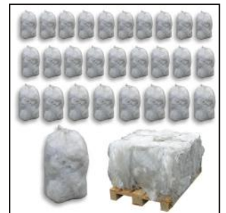
A volume reduction of up to 95%! The built-in ejection device simplifies the ejection of bale.