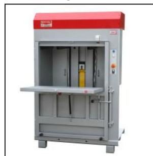
Low loading height, generous feed volume. Close the feed door for automatic compaction.