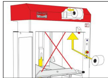
The bale strapping rolls are easily reached at the front. Each roll can be replaced separately.