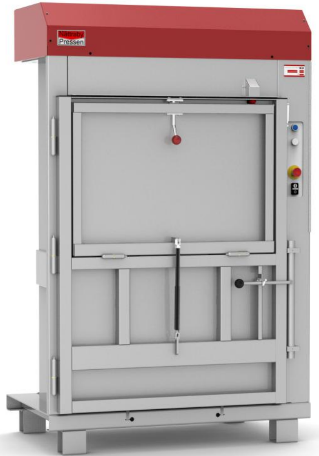
Thanks to its low height, the NP60-II can be placed near the source and can easily be relocated with a pallet truck by changing needs.