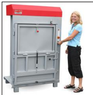
Efficient sorting near the source. The NP60-II is silent-running and provides a good work environment.