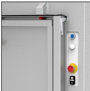
The control system can easily provide additional features for customized solutions.