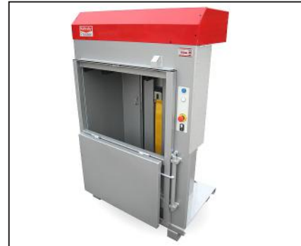
The feed door opens 90° as standard, but can be opened all the way down 180° for customized needs.