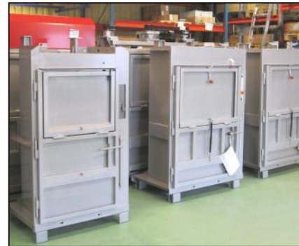
Since the mid-sixties more than 15,000 balers have been delivered all over the world.